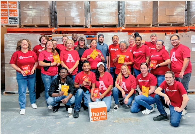
Warehouse Packing Event